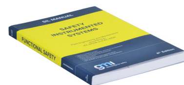
GMI SIL Manual: over 50.000 copies delivered

Contact us or visit our website to find an expert near you and take advantage of the global presence of GM International.